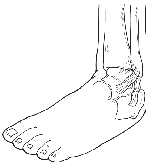
Injured ankle with laxity of ligaments

Chronic ankle instability usually develops following an ankle sprain that has not adequately healed or was not rehabilitated completely. When you sprain your ankle, the connective tissues (ligaments) are stretched or torn. The ability to balance is often affected. Proper rehabilitation is needed to strengthen the muscles around the ankle and “retrain” the tissues within the ankle that affect balance. Failure to do so may result in repeated ankle sprains.